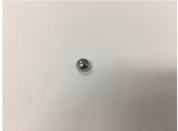
Sample after tested M001 (Trial 1)