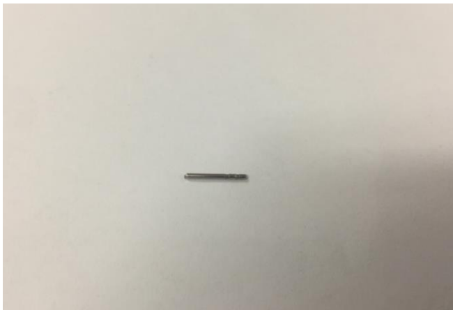
Sample after tested M002 (Trial 3)