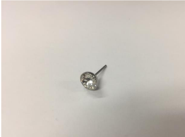
Sample before test