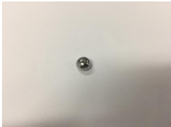
Sample after tested M001 (Trial 2)