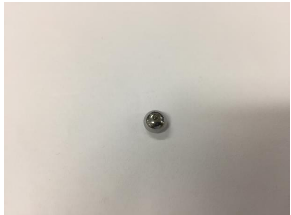
Sample after tested M001 (Trial 3)