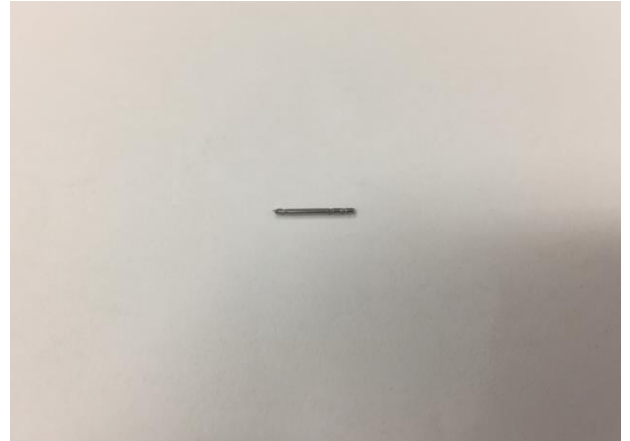
Sample after tested M002 (Trial 3)